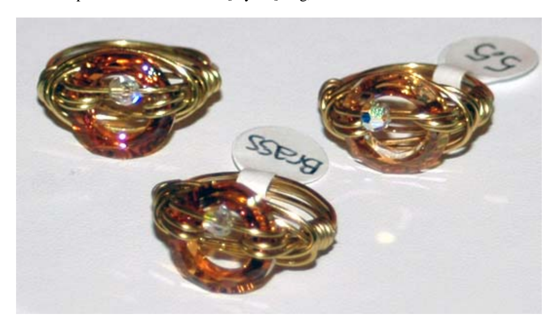
The "Ring of Hope" in non-tarnish brass.